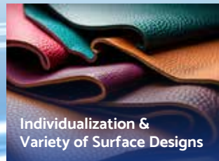
Individualization & Variety of Surface Designs