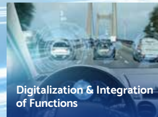
Digitalization & Integration of Functions