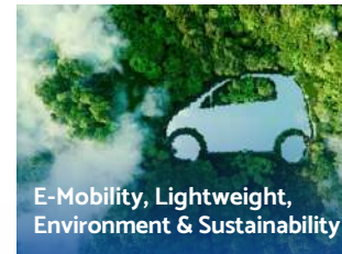
E-Mobility, Lightweight, Environment & Sustainability