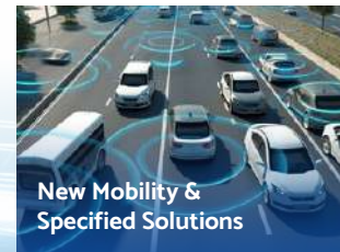
New Mobility & Specified Solutions