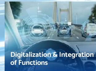
Digitalization & Integration of Functions