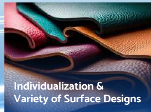
Individualization & Variety of Surface Designs